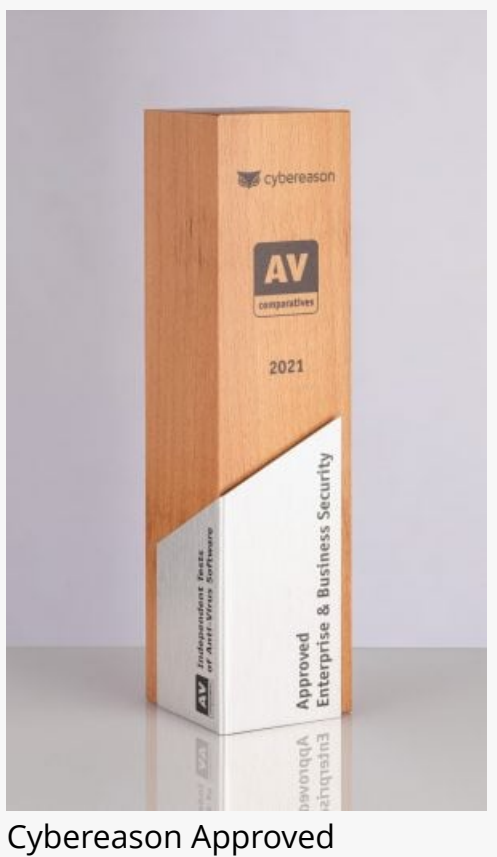
Cybereason Approved Enterprise & Business Security Trophy 2021