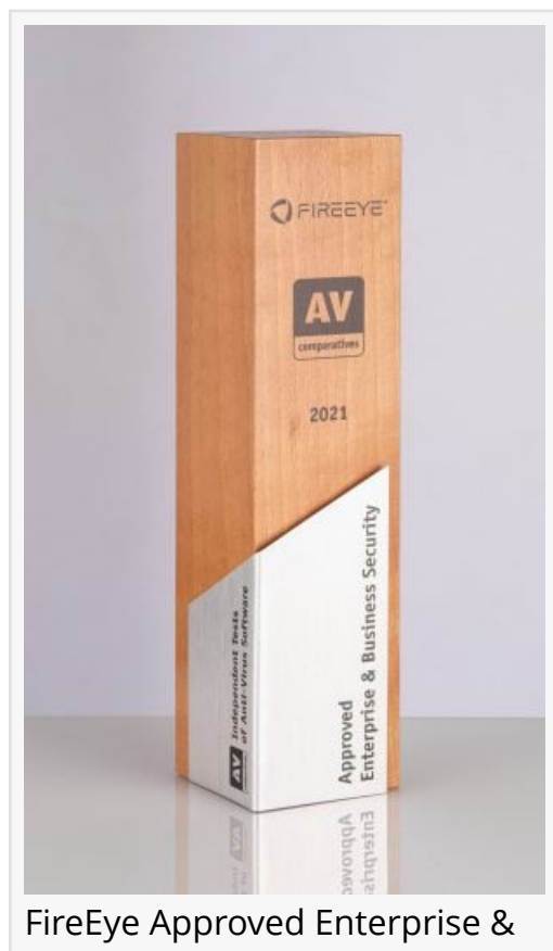
FireEye Approved Enterprise & Business Security Trophy 2021

FireEye performed creditably in AV-Comparatives' Enterprise Main Test Series of 2021. This included a number of rigorous tests, covering different protection scenarios, false positives, and impact on system performance. FireEye Endpoint Security was able to master all of these, and so received an Approved Business Security Product Award for both runs of the series.