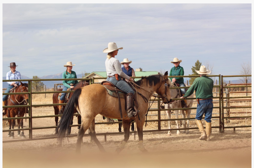
Riding instructors gather to watch and learn

The week started with lunge line practice and riding classes. Fellow instructors critiqued each other's skills and correct use of equipment constructively and to mutual benefit. The Arizona facility had different options for training arenas depending on what the riding session included and what the AZ weather dictated. On one of the days, instructors took turns teaching one another while the master instructor's wife filmed the class. The next day, the instructors watched the session videos and self-critiqued on speaking ability, deliverance, technique, etc. Throughout the week, classroom sessions were conducted with literature reading, educational videos, and discussions on how to be better instructors for the benefit of students, horses, and the horse industry.