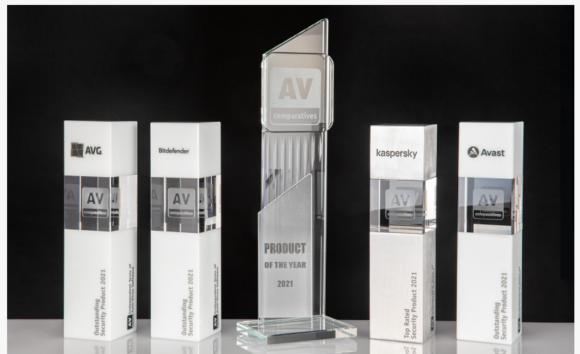
AV-Comparatives Consumer Trophies 2021