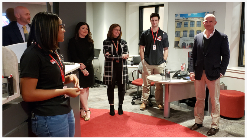
Students from Greenville Federal Credit Union's in-school branch speak with Congressman Timmons.

Timmons talked with the students about the training they received to perform their roles within the student branch. Each year a select group of students earns honors-level course credit in the year-long program. These students participate in a rigorous, paid summer training program to learn about processing transactions, security, fraud prevention and professional responsibilities before opening the branch for the school year. Next year’s class will also be part of LaunchGVL, a work-based learning program facilitated by the Greenville Chamber and Greenville County Schools.