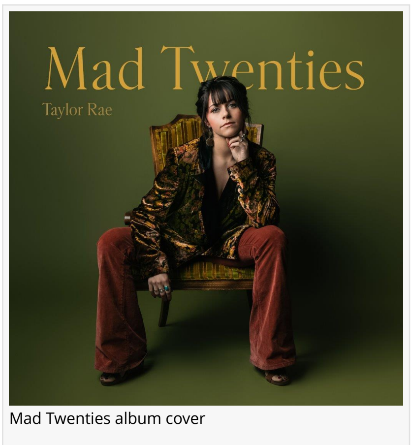
Mad Twenties album cover