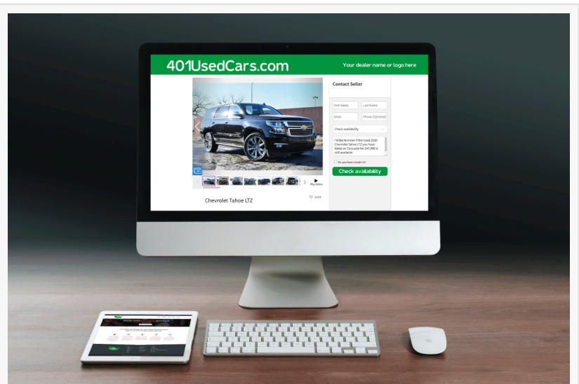
Area Code Domains - Get New Customers

Media Dept Area Code Domains +1 239-799-4466