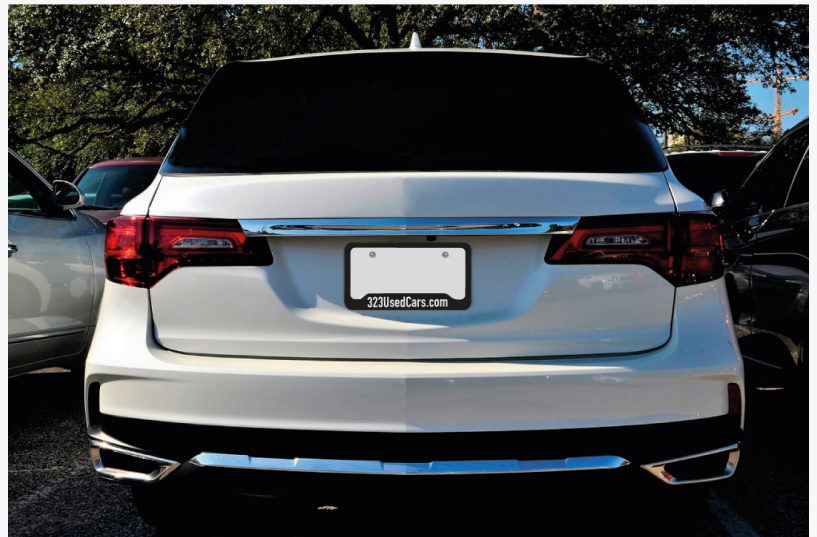
Area Code Domains - Reach New Customers

Their strategy is centralized around providing domain names that feature the business's area code, followed by a keyword for their sector, for example, 323UsedCars.com or 401UsedCars.com .