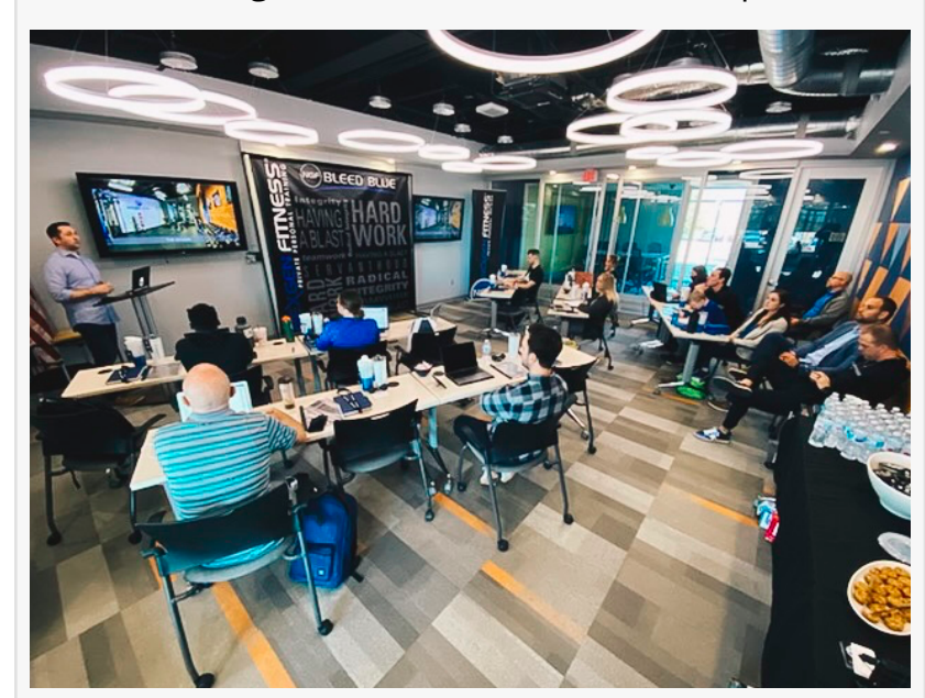
Training the newest Franchisees at the one-week, extensive NexGen U.

Congratulations goes out to their team for 10 years of hard work and the growth they are set to experience.