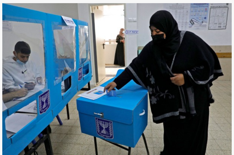
A muslim Arab voting in Israel

During the same period, Belgium's democracy score has fallen steadily, such that the country is placed 21st out of 23 European countries, with only the divided and partially occupied island of Cyprus and Turkey coming lower. The report gave Belgium only five out of ten for political participation, the same as Kazakhstan and Angola.