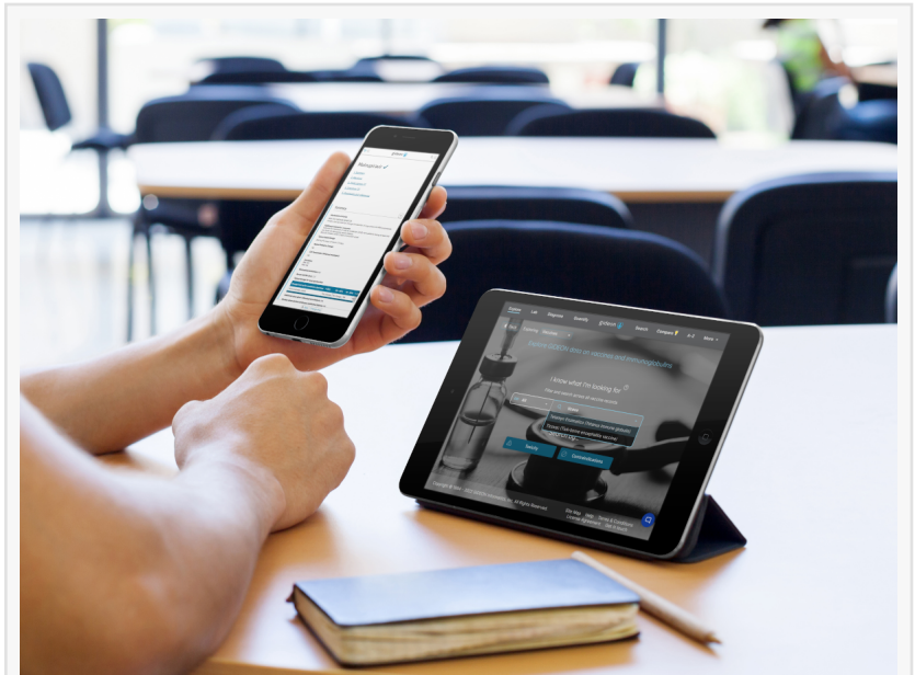
Student browsing the GIDEON application to find information on vaccines