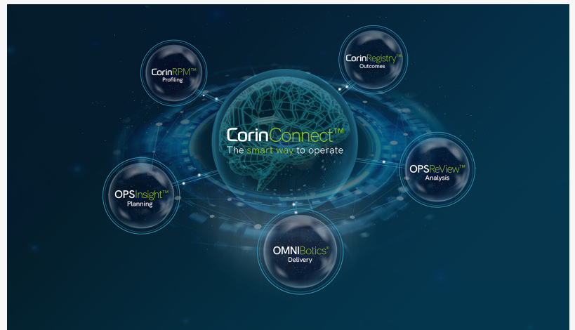
CorinConnect: the smart way to operate

This press release can be viewed online at: https://www.einpresswire.com/article/562776887