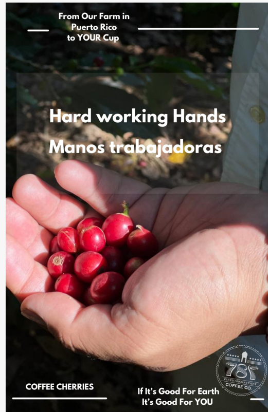
a true human experience