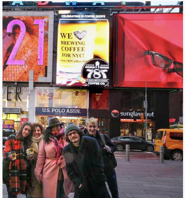
billboard Times Square