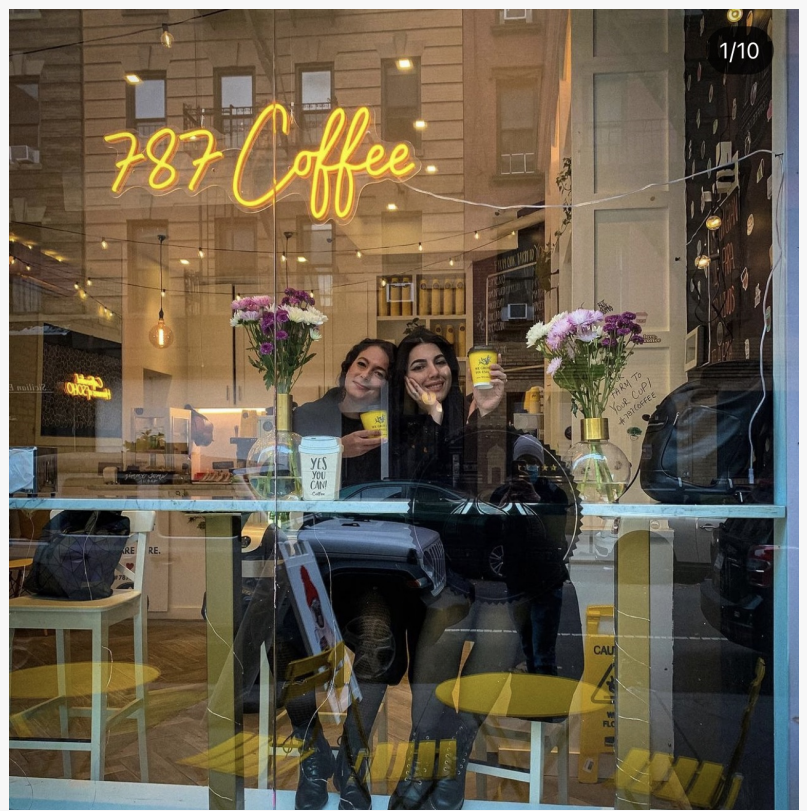
787 coffee - Soho Location 72 Thompson