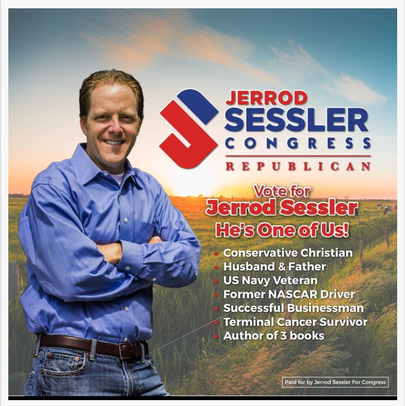
Jerrod For Congress