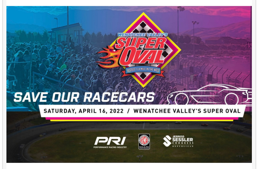
#SAVEOURRACECARS #SUPEROVAL #PRI