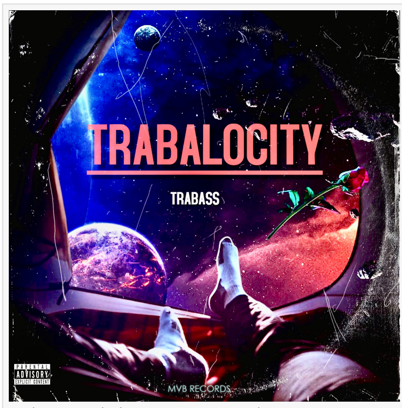
Trabass - Trabalocity Cover Artwork

Recently Trabass made an impressive resurgence on the music charts in the middle of January 2022, when he