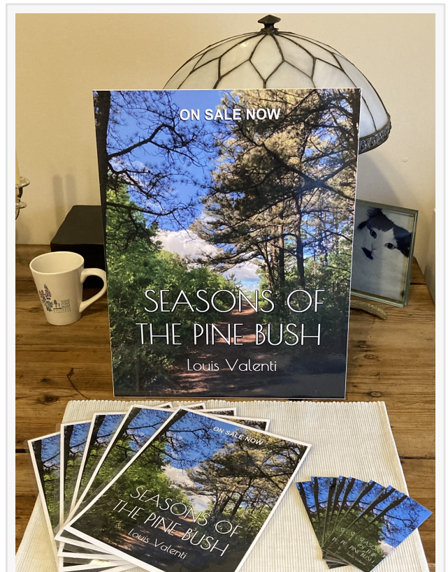
Seasons of the Pine Bush (available in paperback and hardcover)

EAM Recommends Explore Authors Magazine +1 608-576-2064 email us here