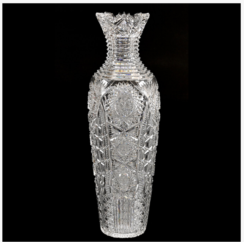
American Brilliant Cut Glass vase signed Clark in the Othello pattern, 17 inches tall, with hobstar base and step cut neck.

This press release can be viewed online at: https://www.einpresswire.com/article/562890098