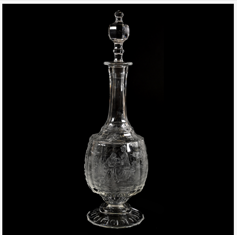
Brilliant Period Cut Glass pedestal decanter by Moser, 15 \frac{3}{4} inches tall, with flawless engraved cutting featuring a courting man and woman near a fountain and lake with swan and tree highlights.

Jason Woody Woody Auction +1 316-747-2694 email us here