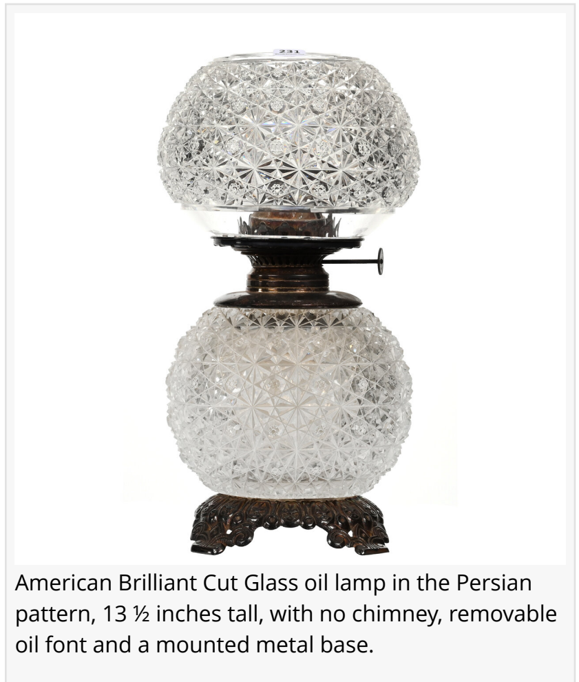
American Brilliant Cut Glass oil lamp in the Persian pattern, 13 ½ inches tall, with no chimney, removable oil font and a mounted metal base.

Woody Auction’s 5,000-square-foot auction hall is located at 130 East 3rd Street in Douglass, Kan. – south and east of Wichita, not far from I-35 and Hwy. 54/Kellogg Road. The firm has many more sales lined up for spring, including an Antique Auction on Saturday, March 19th, and an Antique