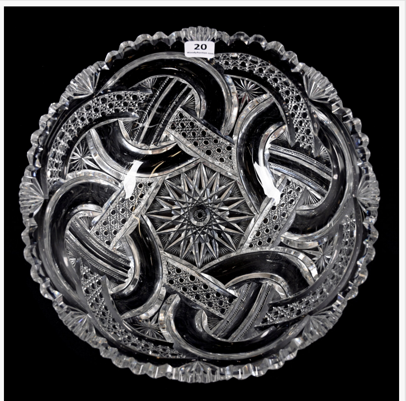
American Brilliant Cut Glass bowl in the Wedding Ring pattern by J. Hoare, 9 ¾ inches in diameter, having an exquisite blank.

Brilliant Period Cut Glass decanters and sets will feature a red cut to clear set in the Cane pattern fluorescing under a black light to indicate it's American, with a pattern cut stopper and selling with ten matching wine stems; and a handled apricot cut to clear decanter, 11 inches tall, with a beautiful embossed floral sterling silver lidded spout marked Theodore B. Starr and a scalloped pattern cut foot.