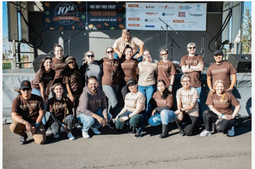
A team of volunteers at Project Boon's 10th Annual Eat & Be Well Event

This press release can be viewed online at: https://www.einpresswire.com/article/562892781