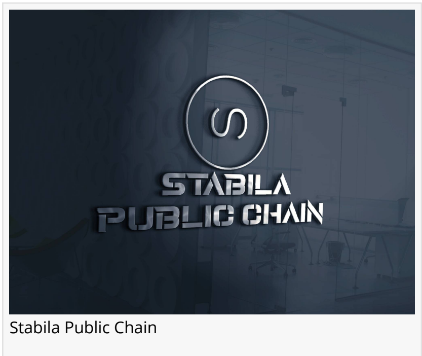
Stabila Public Chain