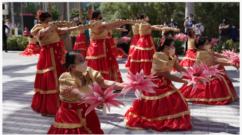
Filipino performers during the Philippines National Parade at the Avenue of Nations, Expo 2020 Dubai

The Philippine flag was raised twice – both in the Philippines Pavilion and in the Al Wasl Dome on Philippines National Day, with many Filipinos singing the Philippine National Anthem with pride at the world's largest 360 projection dome. The Al Wasl Plaza likewise flashed the colors of the Philippine flag in a five-minute special light show together with a soundscape experience that will take visitors to the tides of the "Filipino's soul".