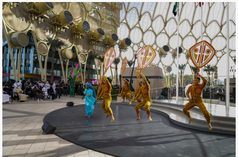
Cultural performance at the Philippines National Day Opening Ceremony at the Al Wasl Plaza, Expo 2020 Dubai

His Excellency Ahmed bin Ali Al Sayegh, Minister of State, together with ranking UAE officials welcomed the Philippine delegation led by Philippine Minister of Trade and Industry and Chairman of the Philippines Organizing Committee for Expo 2020 Dubai H.E. Ramon Lopez during the opening ceremonies in the afternoon.