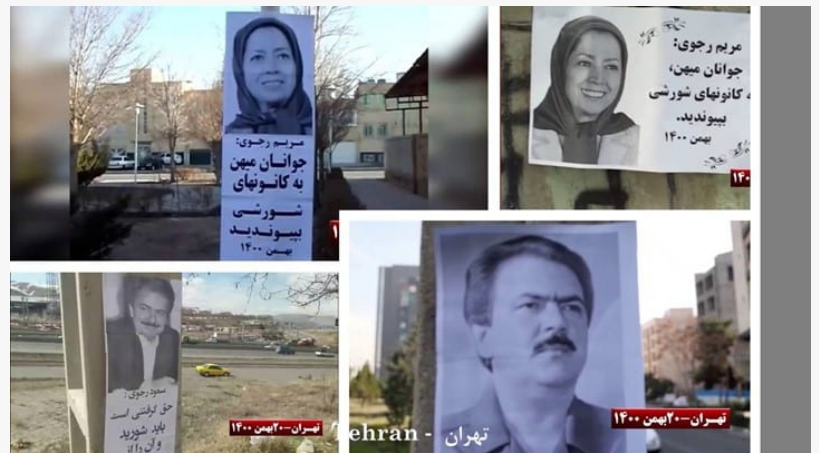
The slogans included, "Maryam Rajavi to Iranian Youths: Join the Resistance Units for Iran's freedom," "Khamenei shame on you, let go of the country,"