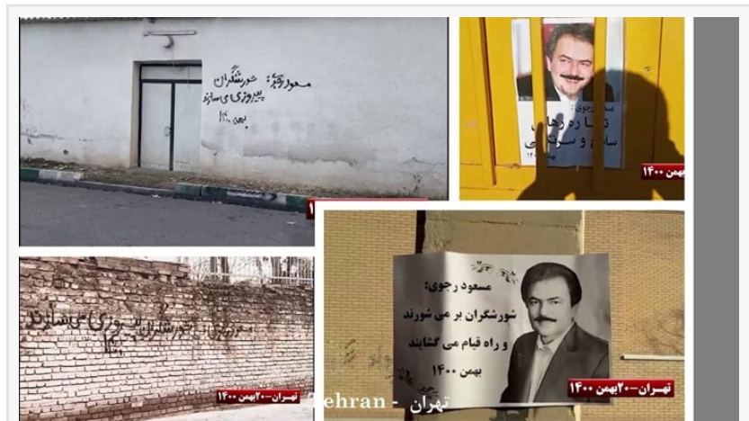
"Massoud Rajavi: Rebels will win the victory," "Massoud Rajavi: Dissolution of the IRGC through the struggle of the rebellious youth is a prerequisite to victory," "Down with Khamenei, hail to Rajavi," "Down with Khamenei and Raisi, hail to Rajavi."

In truth, Khomeini was the rightful heir to the Shah. Half of a century of absolute repression under the Pahlavis destroyed any chance of democracy taking shape in Iran. Democratic movements and organizations were decimated by the Shah's notorious secret police, SAVAK.