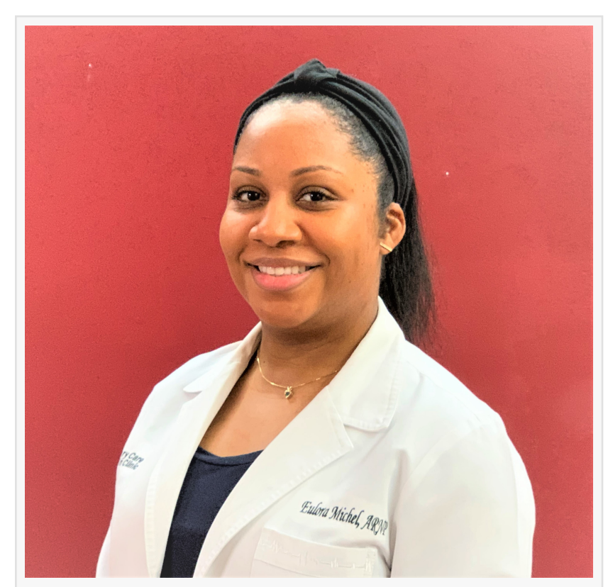
Family Certified Nurse Practitioner

COVID rapid antigen testing from Nose and rapid Antibody from finger stick drop of blood are billed to Insurances. Urgent Care (Medicaid HMOs) and noninsurance patients are charged $25