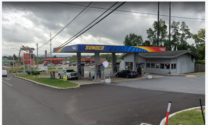
Bitcoin ATM - 887 E Main St, Ephrata, PA 17522