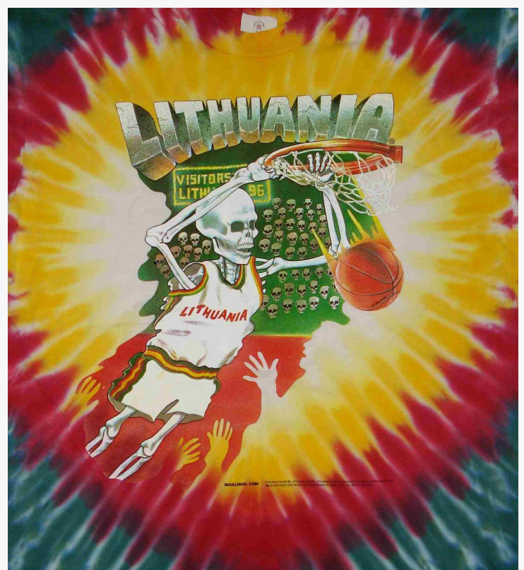
Greg Speirs' original 1992 Barcelona Lithuania Tie Dye® Jerseys. 1992 Copyright & Trademark property of Greg Speirs. All rights reserved.

This press release can be viewed online at: https://www.einpresswire.com/article/563039060