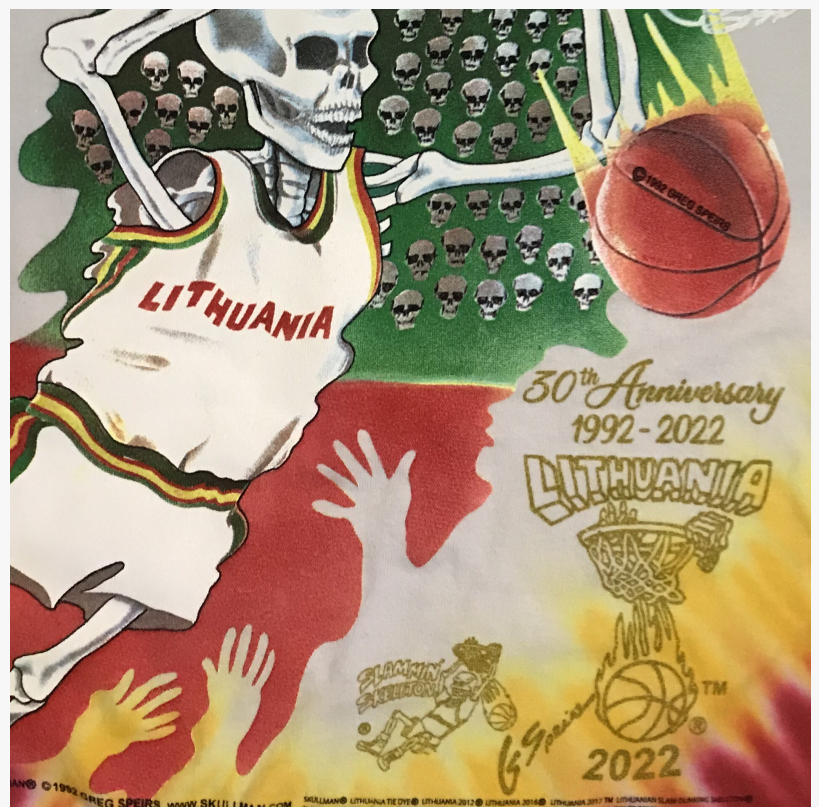
2022 Lithuania Tie Dye ® 30th Anniversary Slam Dunking Skeleton

The Lithuanian Slam-Dunking Skullman® represented the artist's interpretation of a team rising from nothing, "Like a Phoenix from the ashes to slam-dunking a flaming basketball to an Olympic bronze victory. "It's not a dead skeleton, but represents rebirth and a new life. It was not only a victory in Olympic sports, but it was as if it were a triumph over communism itself," recalled