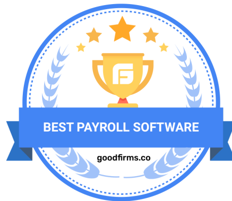
Best Payroll Software_GoodFirms

WASHINGTON DC, WASHINGTON, UNITED STATES, February 14, 2022 /EINPresswire.com/ -- Employees are the essential pillars of every business. Thus, companies must pay the salary to their employees consistently without any delays. Manually managing the payroll can be a complex and time-consuming process. Therefore, today organizations are integrating the payroll tools to make the salary or wages paying process more manageable.