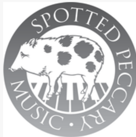
Spotted Peccary Music of Portland, OR