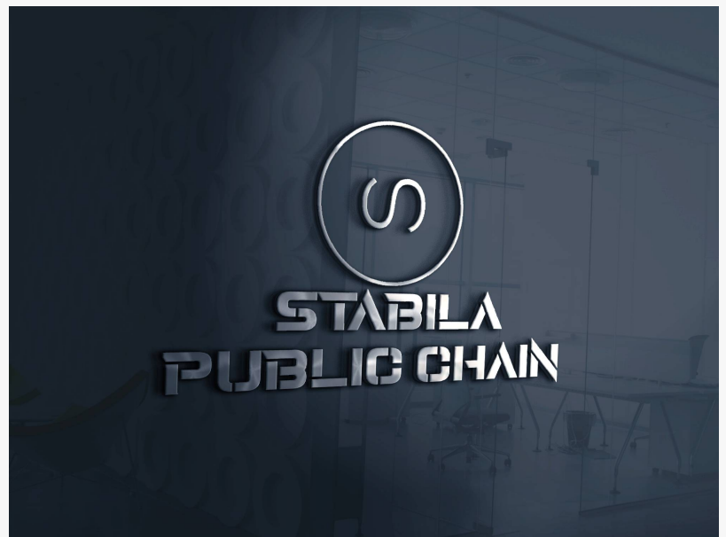
Stabila Public Chain

MUMBAI, INDIA, February 14, 2022 /EINPresswire.com/ -- The Moneta Holdings and Stabila (the Consortium), launched today with a mission to build a network of banks to further the adoption and interoperability of bank-minted stablecoins, which will facilitate the compliant transfer of value on the blockchain, removing friction in the financial system and unlocking the financial opportunities that blockchain and digital transactions can provide to a greater network of users.