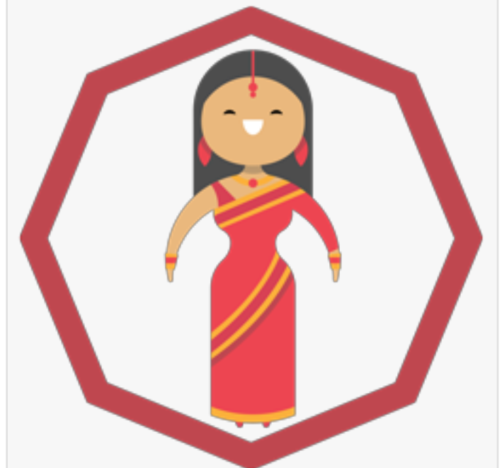
Indian Rupee INRM Stable coin on Stabila blockchain