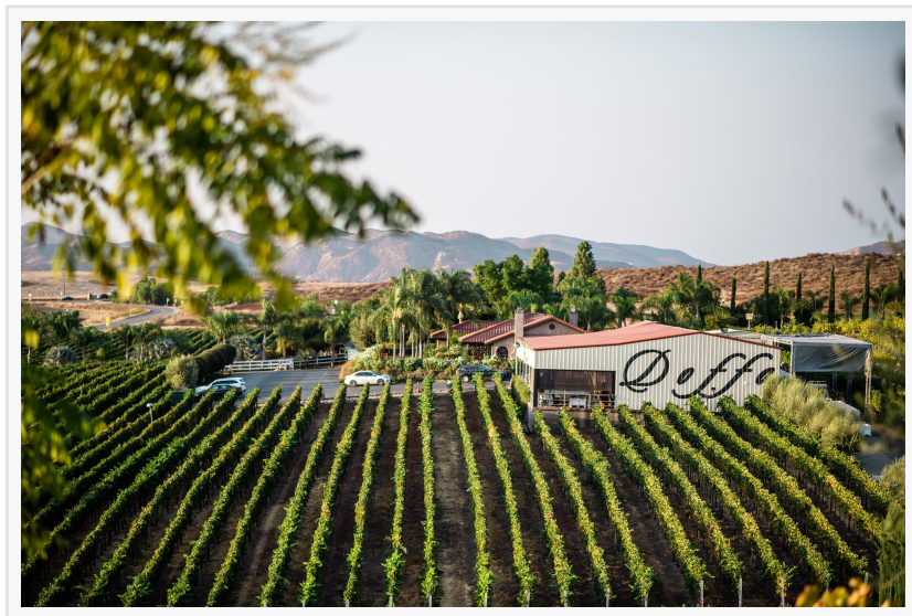
Temecula Valley's Doffo Winery Celebrates 25 Years of Leadership in Southern California Wine

"Dad's legacy is super important to all of us, especially making sure that we