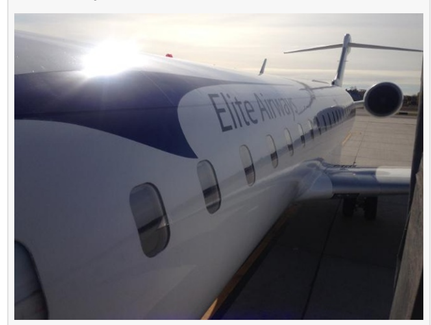
Elite Airways CRJ Jet Aircraft Boarding

Today's announcement is part of a larger rollout of Elite Airways' spring and summer schedule along the east coast and Florida as leisure air travel continues to rebound. In a separate release the airline is announcing expanded service in St. Augustine with the addition of a new nonstop flight to Portland Maine in addition to its existing twice-weekly service to Newark.