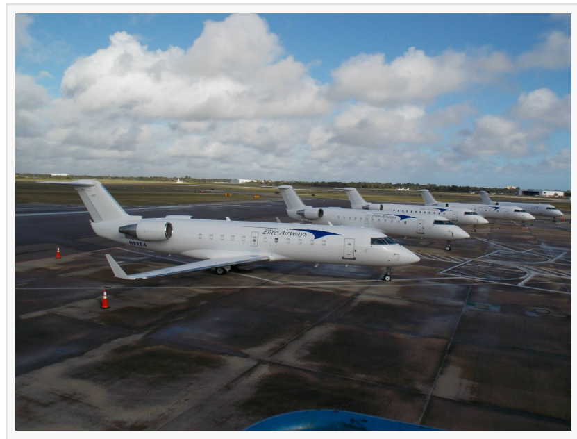
Elite Airways fleet of CRJ Jet Aircraft