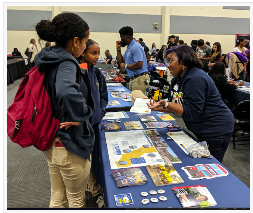
Students speak with college recruiters at Black College Expo 2020

Black College Expo™ (BCE) is a trademark program of National College Resources Foundation (NCRF), a 501c3 non-profit organization that functions daily as a full-service student outreach program in various schools. BCE was founded in 1999 by Dr. Theresa Price as a vital link between minorities and college admissions. NCRF's mission is to curtail the high school dropout rate and increase degree and/or certificate enrollment among underserved, underrepresented, at-risk, low resource, homeless, and foster