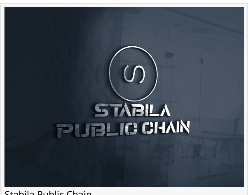
Stabila Public Chain

RIO DE JANEIRO, BRAZIL, February 15, 2022 /EINPresswire.com/ -- The Moneta Holdings and Stabila (the Consortium), launched today with a mission to build a network of banks to further the adoption and interoperability of bank-minted stablecoins, which will facilitate the compliant transfer of value on the blockchain, removing friction in the financial system and unlocking the financial opportunities that blockchain