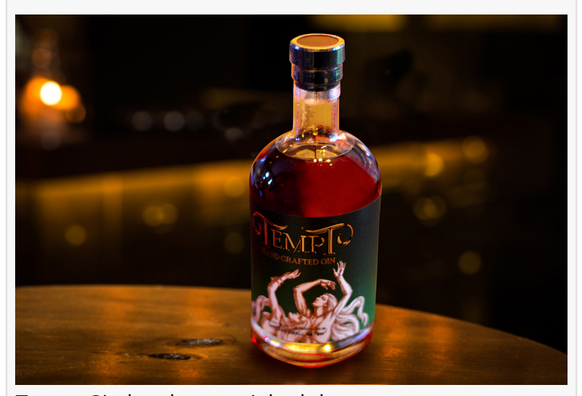
Tempt Gin bottle at a nightclub.

"Word of mouth has been very powerful for us and our growth. Restaurants, bars, and their patrons have shown their appreciation for our Gin. The process we use, and botanical combination reveal flavors with many different dimensions that change from when served neat, on the rocks, or in a cocktail. We are extremely grateful to the south Florida community for embracing our unique creation", Wayne affirms.