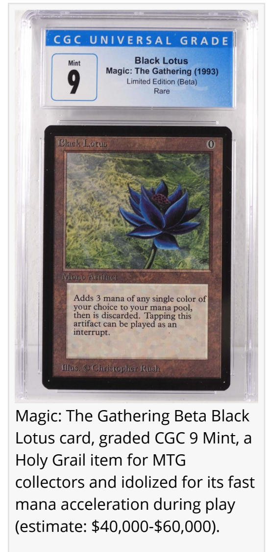
Magic: The Gathering Beta Black Lotus card, graded CGC 9 Mint, a Holy Grail item for MTG collectors and idolized for its fast mana acceleration during play (estimate: $40,000-$60,000).

All five of the expected top lots are MTG cards from a single-owner Virginia collection and all are from 1993. Tip-top among these is a Magic: The Gathering Beta Black Lotus card, graded CGC 9 Mint, a Holy Grail item for MTG collectors (estimate: $40,000-$60,000). It's idolized for its fast mana acceleration during play and is famous for its elegant artwork by Christopher Rush.