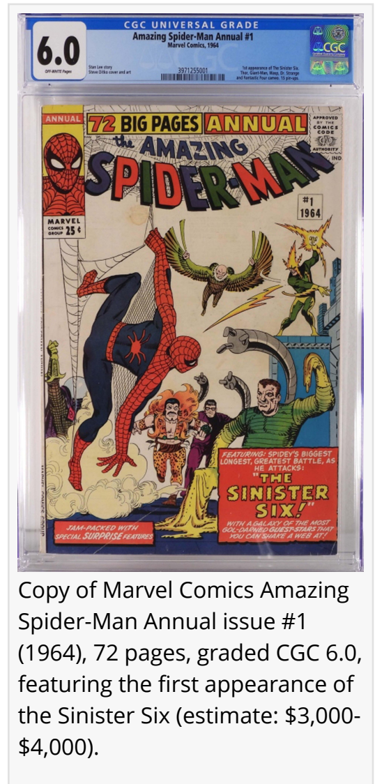
Copy of Marvel Comics Amazing Spider-Man Annual issue #1 (1964), 72 pages, graded CGC 6.0, featuring the first appearance of the Sinister Six (estimate: $3,000-$4,000).