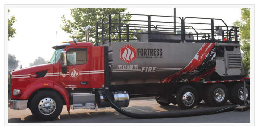
Fortress equipment has the ability to apply a large amount of fire retardant effectively and efficient.

All Risk Shield Corporation is one of the most experienced fire protection companies in California. Both Fortress and All Risk Shield are excited to announce the formation of their formal strategic partnership whereby