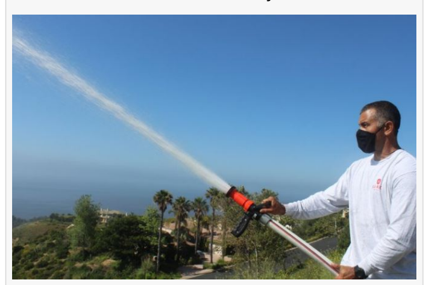
All Risk Shield being proactive and pretreating a home with long term fire retardant

All Risk Shield becomes a Tier One Elite Application Service Provider and will be utilizing Fortress' ground applied products in their property defense efforts in the 2022 fire season.