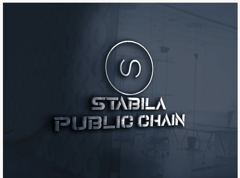
Stabila Public Chain

ISLAMABAD, PAKISTAN, February 16, 2022 /EINPresswire.com/ -- The Moneta Holdings and Stabila (the Consortium), launched today with a mission to build a network of banks to further the adoption and interoperability of bank-minted stablecoins, which will facilitate the compliant transfer of value on the blockchain, removing friction in the financial system and unlocking the financial opportunities that blockchain and digital transactions can provide to a greater network of users.