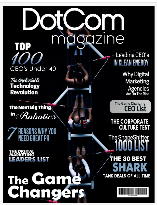
The DotCom Magazine Game Changers Edition

DotCom Magazine is a leading news platform providing fascinating interviews with news makers, thought leaders, and entrepreneurs. DotCom Magazine is the leader in putting people with insatiable entrepreneurial spirit at the forefront of every story it covers. The Entrepreneur Spotlight