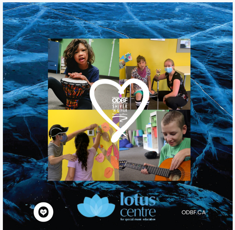
ODBF Shiver 'N Giver Fundraising Drive Supports The Lotus Centre For Special Music Education