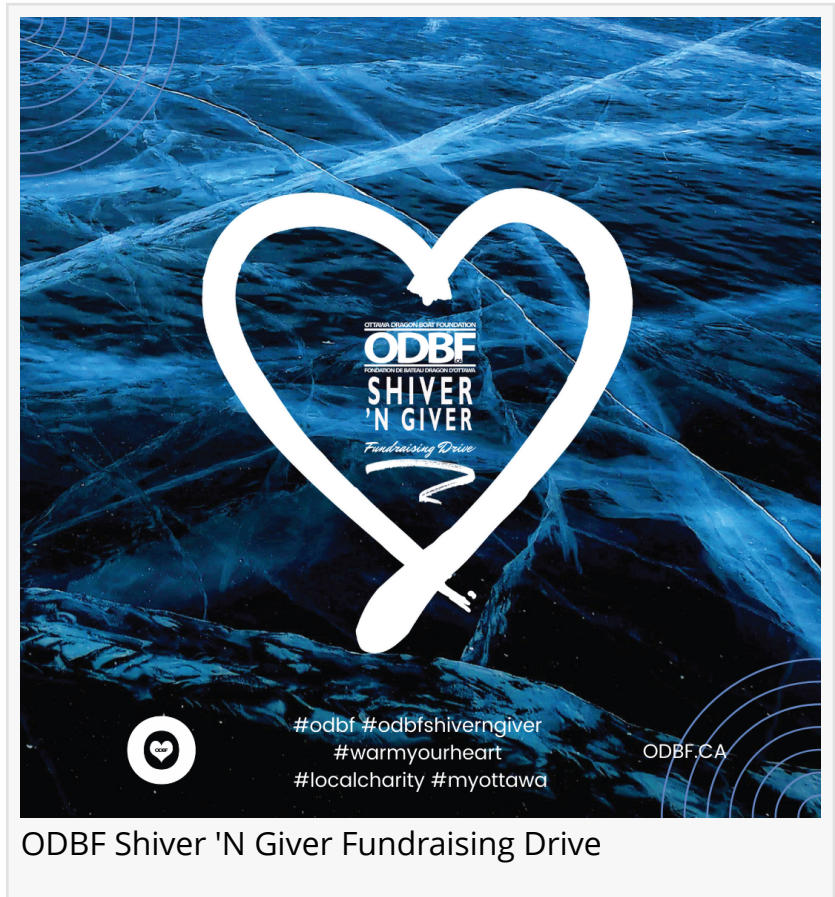
ODBF Shiver 'N Giver Fundraising Drive

The Snowsuit Fund is an Ottawa-based charity that raises funds for the purchase and