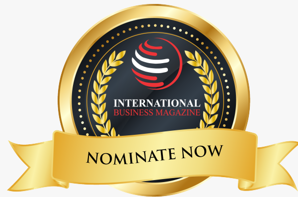
International Business Magazine Awards 2022

DUBAI, UNITED ARAB EMIRATES, February 17, 2022 /EINPresswire.com/ -- International Business Magazine, the UAE-based leading business magazine, is now accepting nominations for its 2022 Annual Awards. The Magazine is inviting top business professionals, entrepreneurs, and organizations to send in their entries for the top honors in the business fraternity.