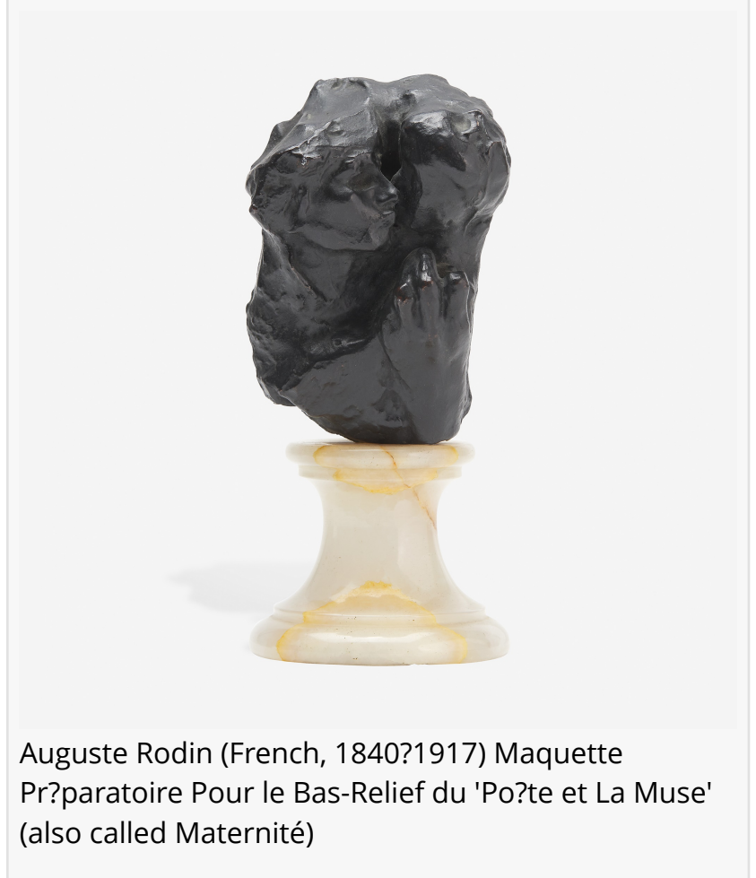
Auguste Rodin (French, 1840-1917) Maquette Préparatoire Pour le Bas-Relief du 'Poète et La Muse' (also called Maternité)