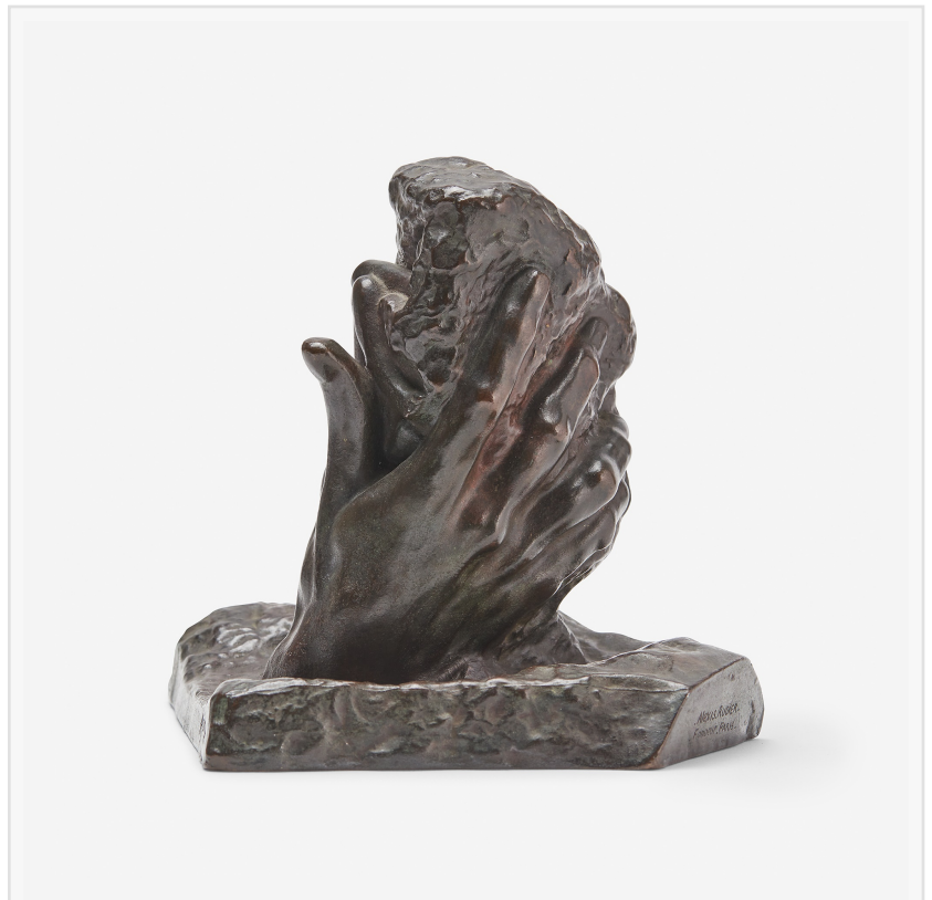
Auguste Rodin (French, 1840-1917) La Main de Dieu (Petit Modèle)

* Jean-Baptiste-Camille Corot's Le Rappel des Vaches (lot #27; estimate: $100,000 – $150,000)