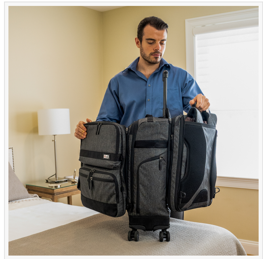
The modular Revolution Rolling Pack, which splits into three bags.

Boston - March 5th and 6th Los Angeles - March 12th and 13th New York - March 19th and 20th