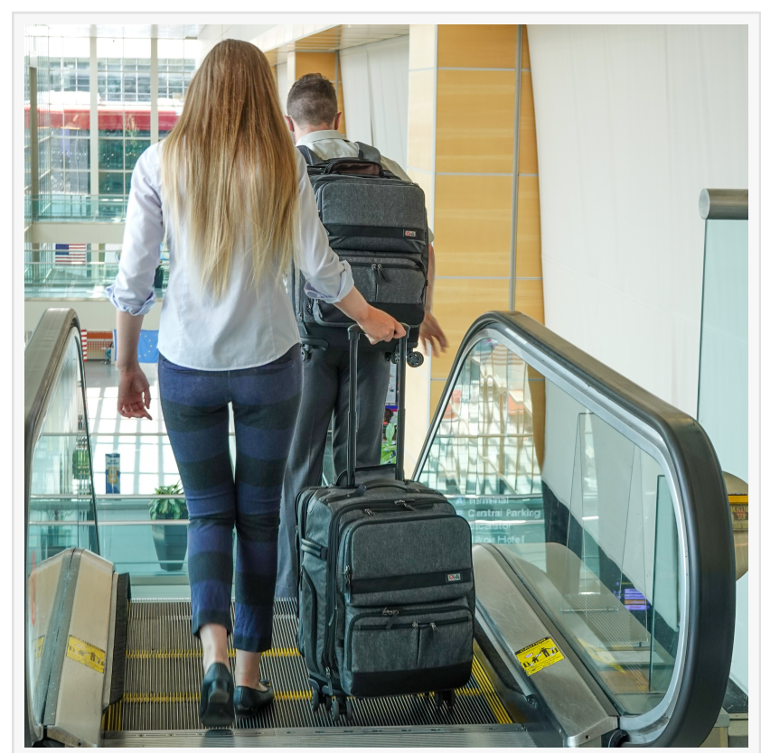
The Revolution Rolling Pack can be rolled as a 4-wheel spinner or carried as a backpack.

An infographic of the system's main capabilities is at <a href="https://onlitravel.com/pages/revolution-rolling-pack">https://onlitravel.com/pages/revolution-rolling-pack</a>.