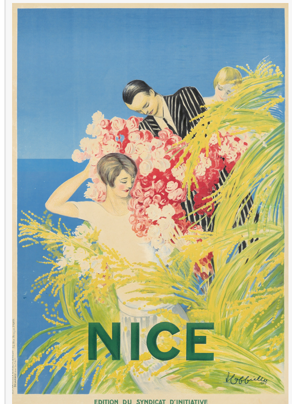
Leonetto Cappiello, Nice, 1927 (estimate: $7,000-$9,000).