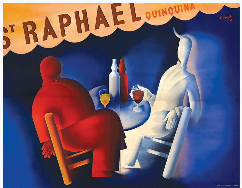
Charles Loupot, St. Raphaël / Quinquina, 1938 (estimate: $35,000-$45,000).

All 425 lots will be on view to the public February 25 through March 19. The auction will be held live in PAI's gallery at 26 West 17th Street in New York City, as well as online at posterauctions.com , beginning promptly at 11am EDT.