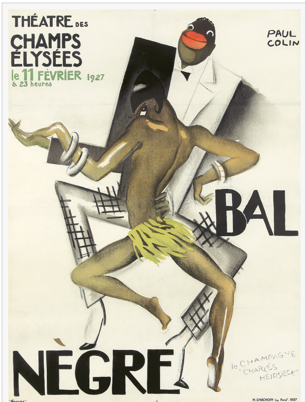
Paul Colin, Bal Nègre, 1927 (estimate: $70,000-$90,000).