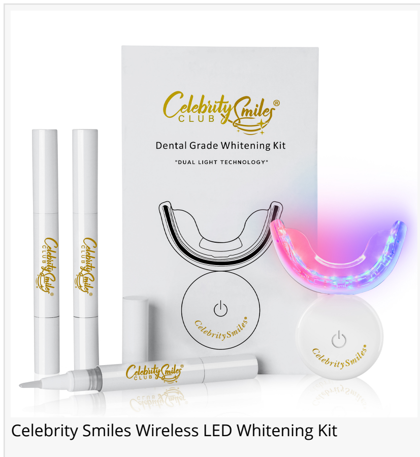
Celebrity Smiles Wireless LED Whitening Kit

Another advancement in the Celebrity Smiles Club whitening system is the dental-grade serum. Consumers were only recently able to buy this type of professional, dental-grade ingredients, for whitening teeth when they went to a dental office. The Celebrity Smiles serum is professionally formulated in a safe lab with the ultimate safety/ sterile procedures in mind. The manufacturing facility is kept at a low temperature (less than 75 F degrees) to preserve the quality and integrity of the serum before it arrives in the hands of consumers.