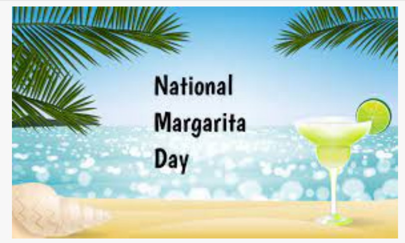
National Margarita Day 2/22/22

"To me," McDonald admits, "it's nothing short of amazing how one song crystallized such an identifiable genre of music and a vast network of loyal music lovers, who also support independent singer songwriters."