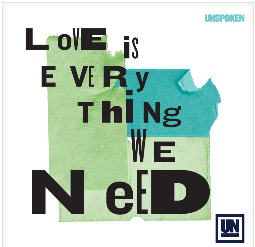
Unspoken, "Love Is Everything We Need" cover artwork