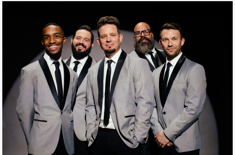
Unspoken

NASHVILLE, TN, UNITED STATES, February 18, 2022 /EINPresswire.com/ -- Centricity Music recording artist Unspoken releases “Love Is Everything We Need” to radio, digital retail and streaming outlets everywhere today (Feb. 18). The band’s debut single of 2022 is also the lead song from its first full-length album in three years, which is slated to release in July.