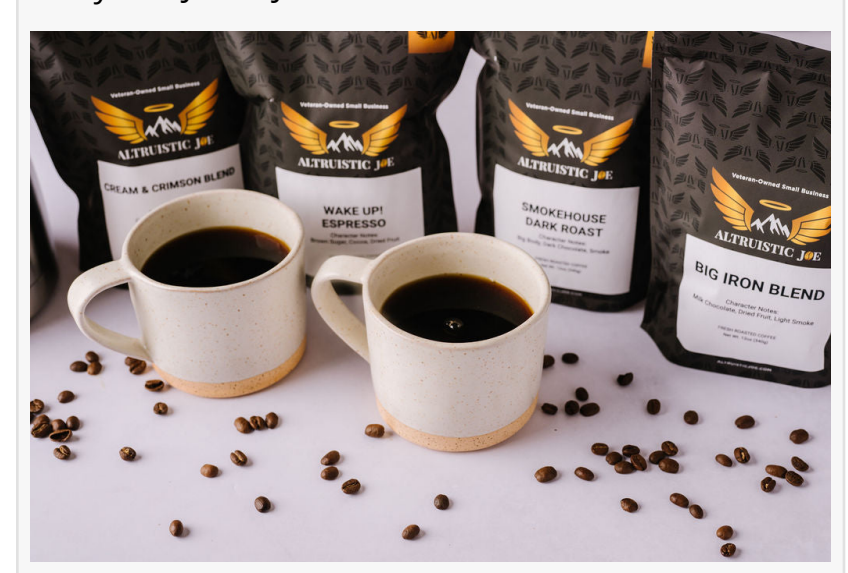
Altruistic Joe Coffee Year Round Blends

individual philanthropists, local businesses, church groups, or community fundraisers that can benefit from selling a new blend fashioned especially for them. Each product comes complete with its own charitable coffee label, i.e., "Shocker Grind for a softball program and "Blue Boy Blitz' for a college football program." The beanery takes it one step further by providing a custom website, supported, and fulfilled by Altruistic Joe.