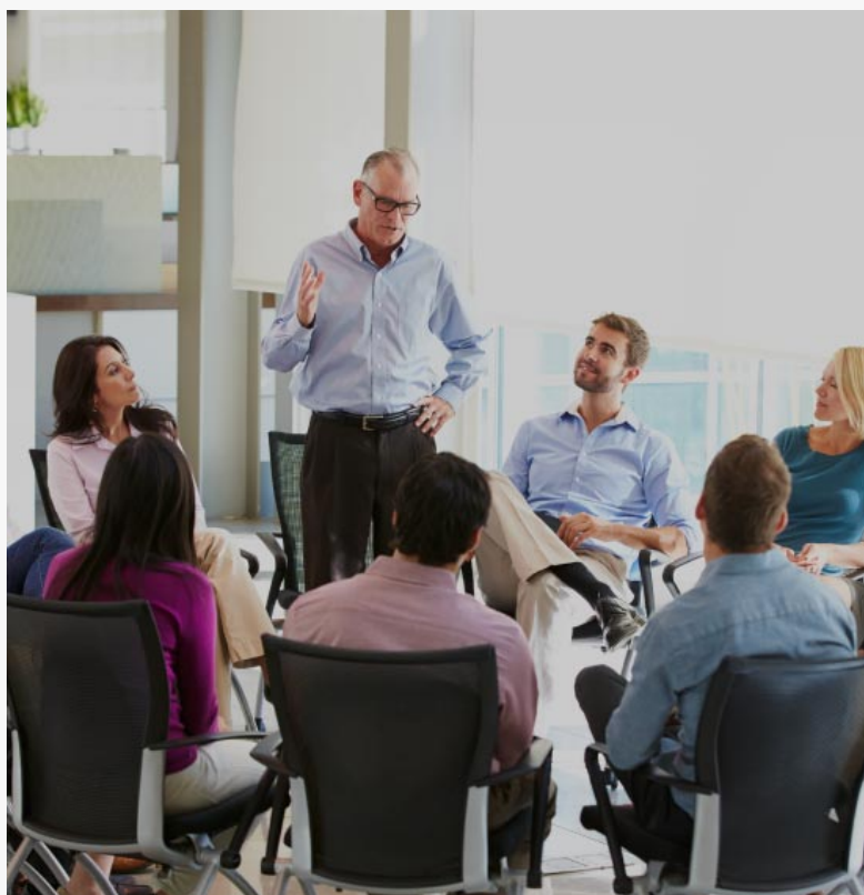
WeLevelUp NJ Addiction Treatment

As of June 2020, 13% of Americans reported starting or increasing substance use as a way of coping with stress or emotions related to COVID-19. Overdoses have also spiked since the onset of the pandemic. A reporting system called ODMAP shows that the early months of the pandemic brought an 18% increase nationwide in overdoses compared with those same months in 2019.