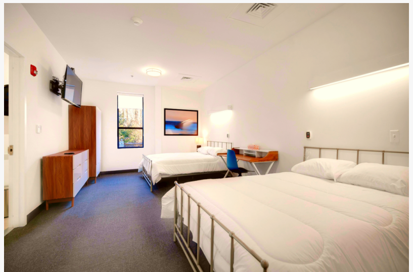
Newly furnished New Jersey Rehab with private rooms.