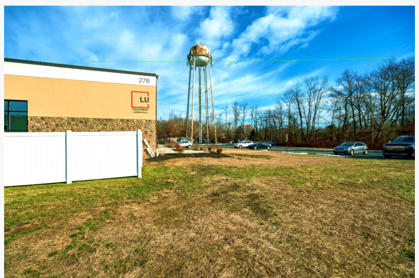
New Jersey Rehab with Open Sky Views

for our clients. Each of our facilities is staffed by highly-trained specialists ready to help patients and their families achieve long-term recovery success. We're excited to announce our first facility