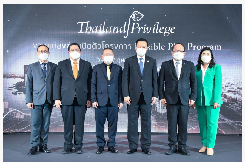
Group Photo - Management Team & Guest Speakers.

Eligible foreign investors entitled for Flexible Plus Program including Thailand Privilege Card member which