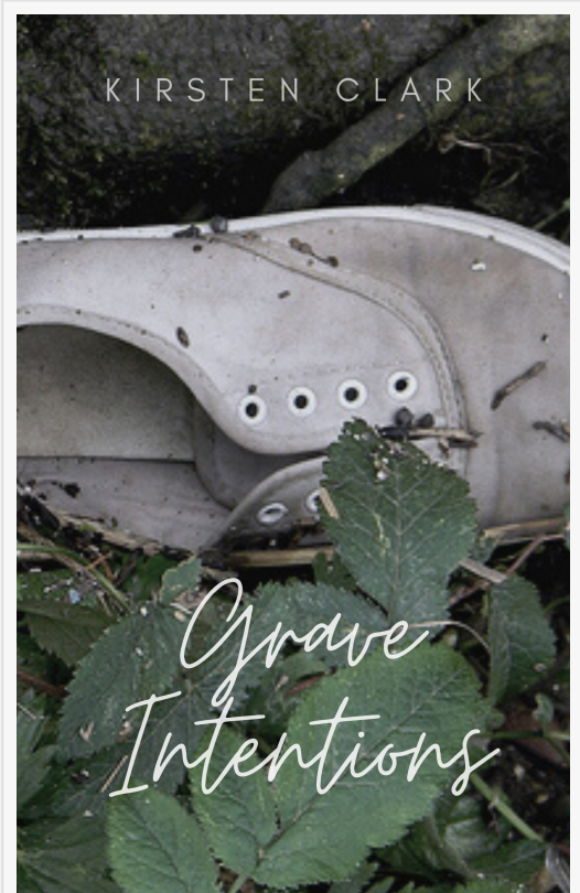
Grave Intentions - the first book in the Sarah Graham series