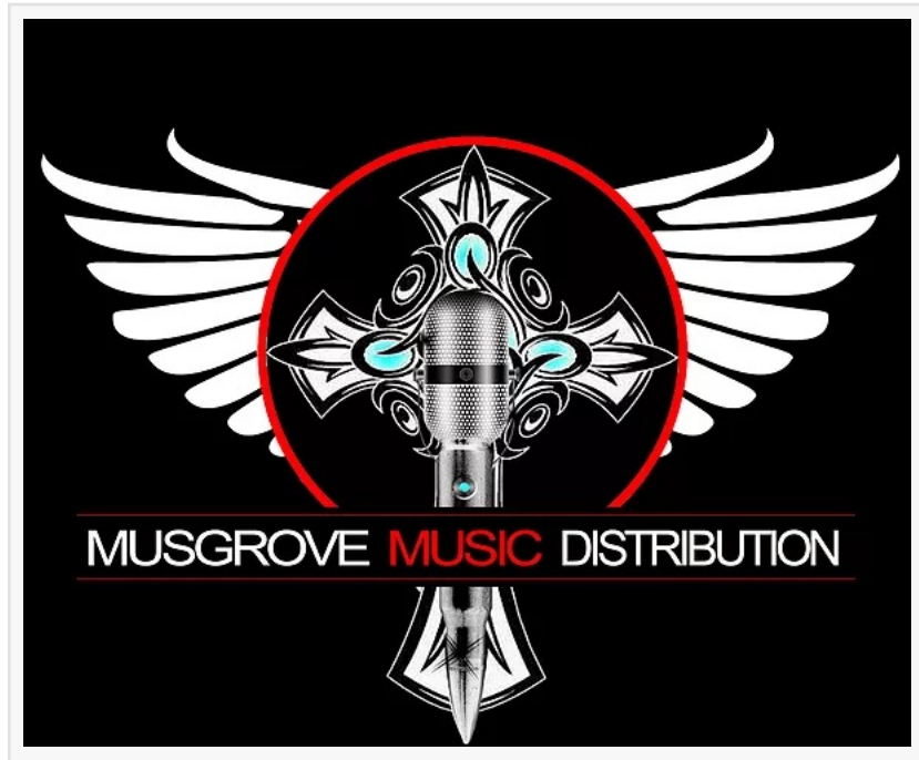
Musgrove Music Distribution is the "One-stop Shop" for all your music production and music distribution needs.

DANIEL MUSGROVE MUSGROVE MUSIC DISTRIBUTION +1 954-257-9955 email us here