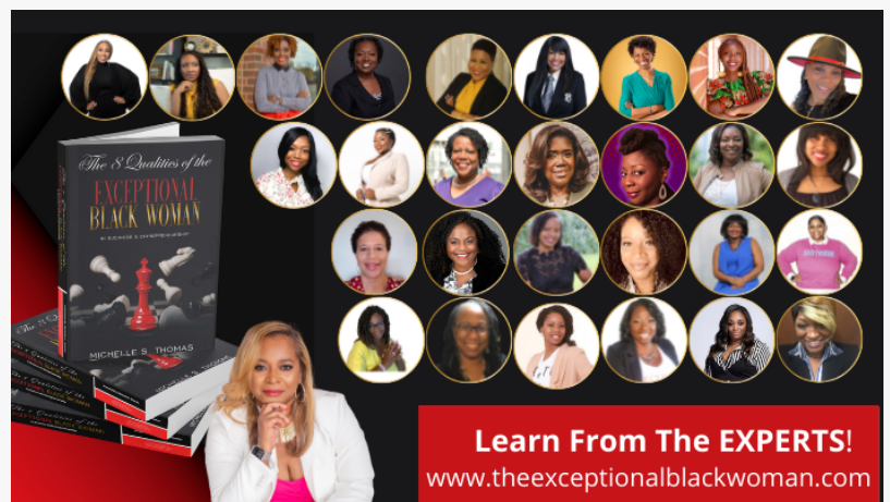
Exceptional Black Woman