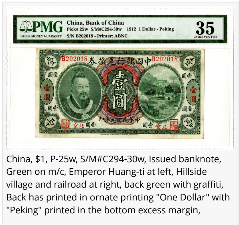
China, $1, P-25w, S/M#C294-30w, Issued banknote, Green on m/c, Emperor Huang-ti at left, Hillside village and railroad at right, back green with graffiti, Back has printed in ornate printing "One Dollar" with "Peking" printed in the bottom excess margin,

The auction begins with World Banknotes, from countries Angola to Yugoslavia, highlighted by 137 lots of Chinese banknotes and bonds and 69 lots of Russian banknotes, with all of these from an old-time collection being offered for the first time at auction. Some of the many Chinese banknote highlights include a Bank of China, 1912, $1, "Peking" Branch Issue rarity; 1919, Shanse Provincial Bank, "Tientsin" Branch issue discovery note that was previously unlisted; Central Bank of China , 1949 Unlisted Face & Back Essay Banknote, Gold Yuan Issue; dozens of desirable and rare Chinese high-grade banknotes; and a Bank of Taiwan - Kinmen Branch. 1955 high-grade issue banknote. Additional highlights of the World Banknote section include a desirable Lebanon, Banque de Syrie et du Grand-Liban, 1925, 25 Piastres, P-2 banknote rarity; a Mexico, 1897, highest graded and issued banknote, the only example graded in the PMG census with no examples of this type ever having been offered previously at auction; and, 3 different Mongolia,