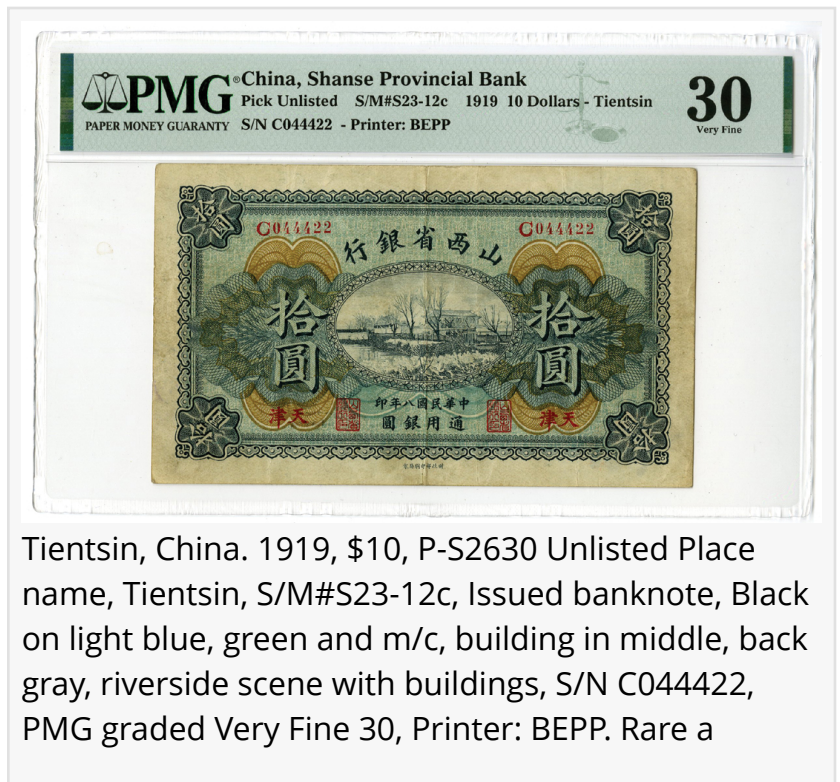
Tientsin, China. 1919, $10, P-S2630 Unlisted Place name, Tientsin, S/M#S23-12c, Issued banknote, Black on light blue, green and m/c, building in middle, back gray, riverside scene with buildings, S/N C044422, PMG graded Very Fine 30, Printer: BEPP. Rare a

Some of the many Russian banknote highlights include 5,000 and 10,000 Ruble, 1919 State Currency Notes in high grade; a full assortment of 1918 State Treasury Notes from 1 Ruble to 1000 Rubles in attractive and some very high Uncirculated grades; the 1922 series State Currency Notes include 3 Rubles to 1000 Rubles in various grades, mainly Choice AU to Uncirculated and many other desirable Russian notes.